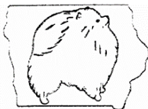
POMERANIAN CLUB OF GREATER DES MOINES, INC.

Pomeranian Club of Greater Des Moines, Inc