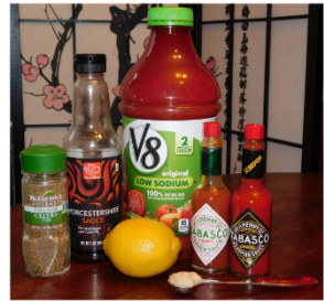
Bloody Mary Basket