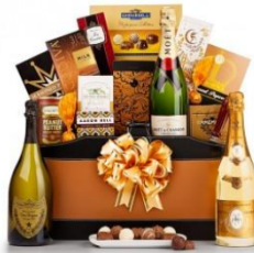
Wine, Cheese & Crackers