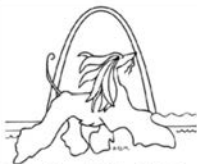
Afghan Hound Club of St. Louis